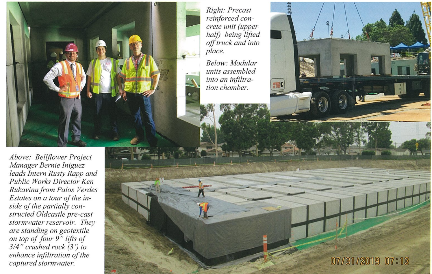
Right: Precast reinforced concrete unit (upper half) being lifted off truck and into place.