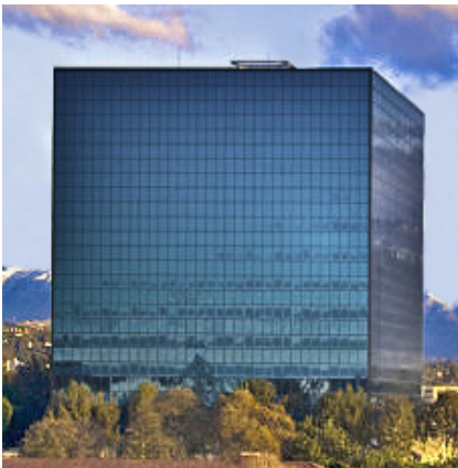
County of Los Angeles, Department of Public Works