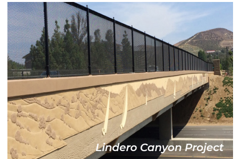
Lindero Canyon Project