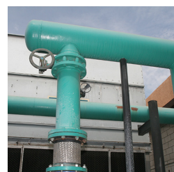
Energy Efficiency and Water Conservation Upgrades at Hilton Bayfront, San Diego, CA