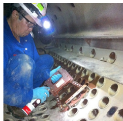
Queens College Boiler Plant Condition Assessment and Upgrade

Willdan Energy Solutions is a nationwide engineering consulting firm that serves investor and municipal owned utilities, private sector and government clients through our regional offices. We develop and implement comprehensive energy solutions for our customers in the data center, healthcare, hospitality, schools, laboratory, municipal/government, and small and large business sectors.