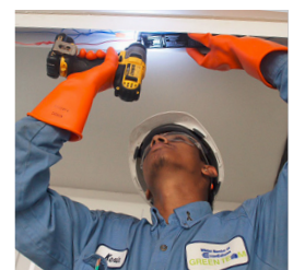
Direct installation of Energy Conservation Measures (largest direct install program in the country), ConEd Small Business Direct Install, New York, NY

To date, Willdan has served more than 125,000 customers with 75,000+ projects that have prevented 1M metric tons of greenhouse gas emissions , saved 1,600 GWh and reduced demand on the grid by 215,000+ kW . Willdan has obtained more than $200M in incentives and rebates on behalf of our customers to reduce implementation costs and maximize financial returns.