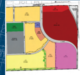
City of Lodi Reynolds Ranch Conceptual Land Use Plan