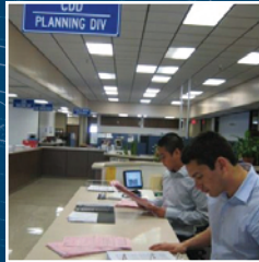
City of Napa Staff Augmentation