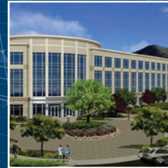
City of Westlake Village Opus West Russell Ranch EIR