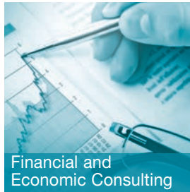
Financial and Economic Consulting