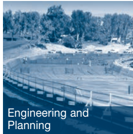
Engineering and Planning